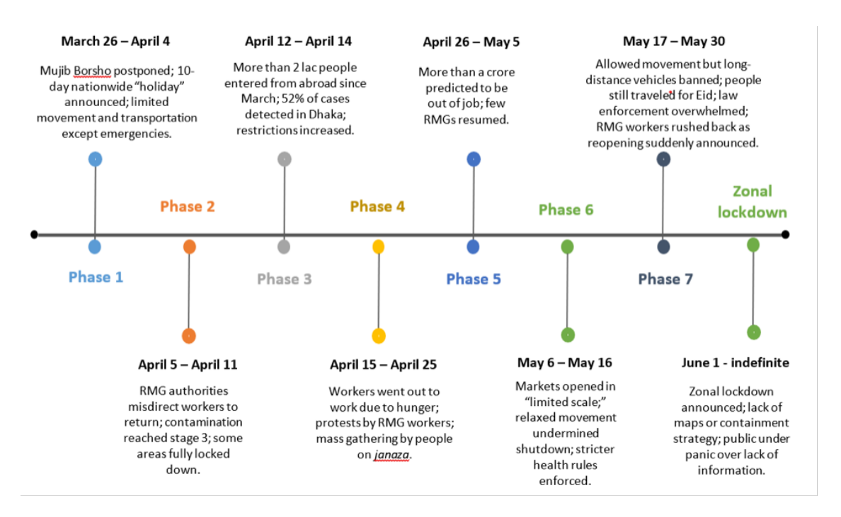
Figure 4.1 A timeline of initial policy responses to the Covid-19 pandemic, March–June 2020