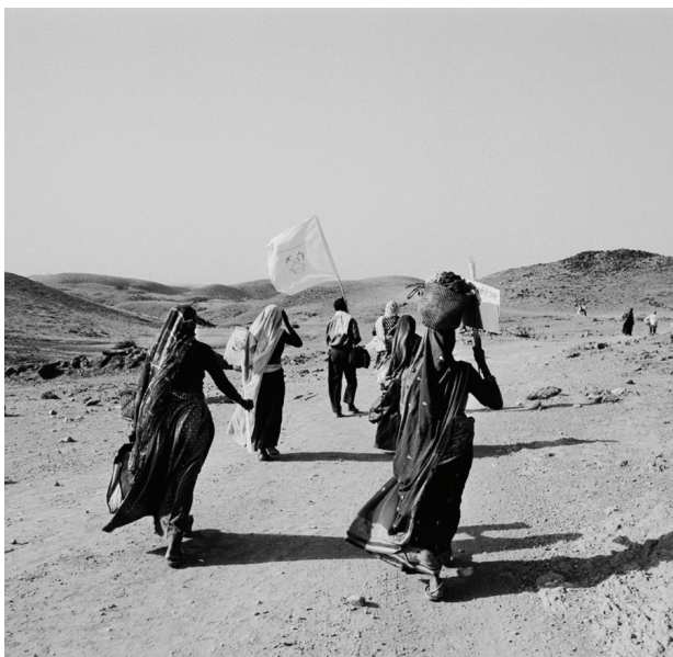
The Rozgar Adhikar Yatra, campaigning for the passage of an employment guarantee law in 2002.

Any social accountability framework, however, needs to continuously evolve. It can do so by remaining relevant in every dynamic intersectionality of the State, society, and citizens. Efforts to expand the scope of social accountability need to continue to emanate from and remain connected to social movements and campaigns.