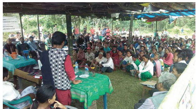
Public hearing in East Garo Hills, Meghalaya, where Government officials respond to social audit findings in a public platform.