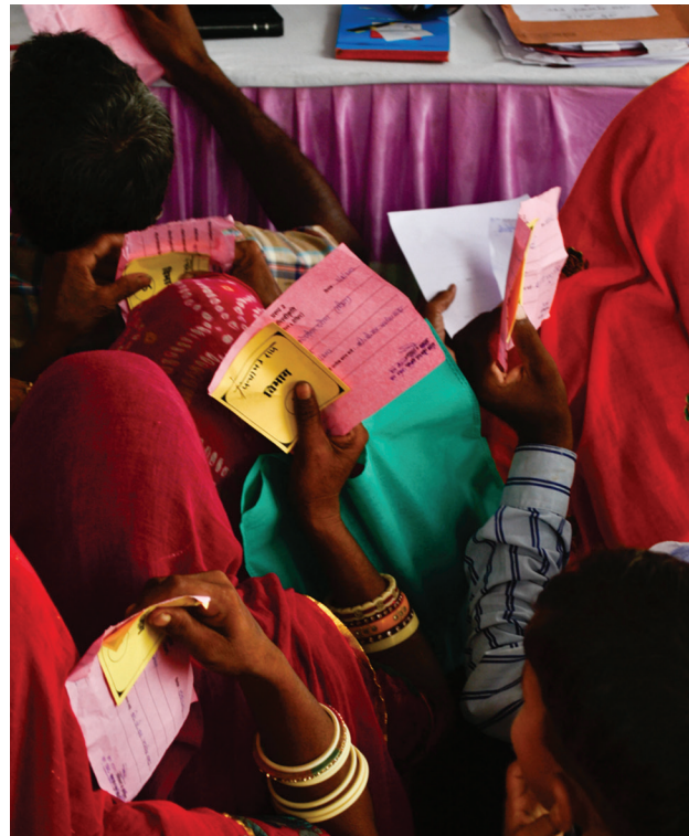
Women holding dated acknowledgement slips at a Right to Hearing Camp organized by the Government of Rajasthan under the Right to Hearing Act.

Once people understand what the State is accountable for, they will need to make themselves heard and pinpoint the violation. Yet ordinary citizens face multiple challenges when trying to be heard—particularly given the imbalance of power with the administration. What will constitute a ‘legitimate’ grievance? Where will the citizens go to file their grievances? What do they need to write while reporting their grievances? Does anything need to be submitted to supplement the grievances? What if the citizens are unable to write their own grievances? What do they do when their grievances are not accepted by the officials who are supposed to receive them? The range of uncertainties that potential complainants face is not restricted to a particular class or community. Nevertheless,