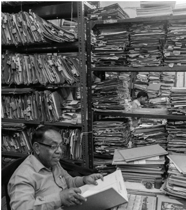
State Official surrounded by files in an Indian government office. Poor record keeping increases the likelihood that complaints are misplaced.

does not exist. Most often, a theoretical understanding is gleaned retrospectively from collective demands that have emerged, and is refined over time. The codification of these basic demands and principles in legalese, and their conceptualization as theory, takes place much later, when more powerful people with access to their collective articulation as well as to elite institutions of academia and policy attempt to bring together, classify, understand, and arrange the pattern of these human efforts and experiences. The introduction of the Bhilwara Framework into theoretical discourse is an attempt to remind us of those who define original theories and yet only see them as mere extensions of their struggles for justice and equity.