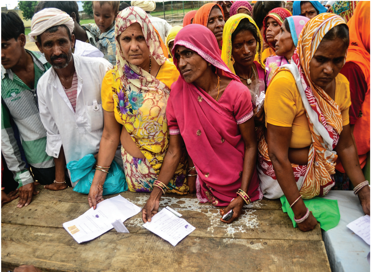
Women submitting complaints at a Right to Hearing Camp organized by the Government of Rajasthan under the Right to Hearing Act.

These interconnected efforts have emerged from concerted grassroots struggles and refined by social movements and ordinary citizens and users of India's various rights-based legislation. These essential struggles deepen social accountability strategies, rooting them firmly in social justice and participatory democracy.