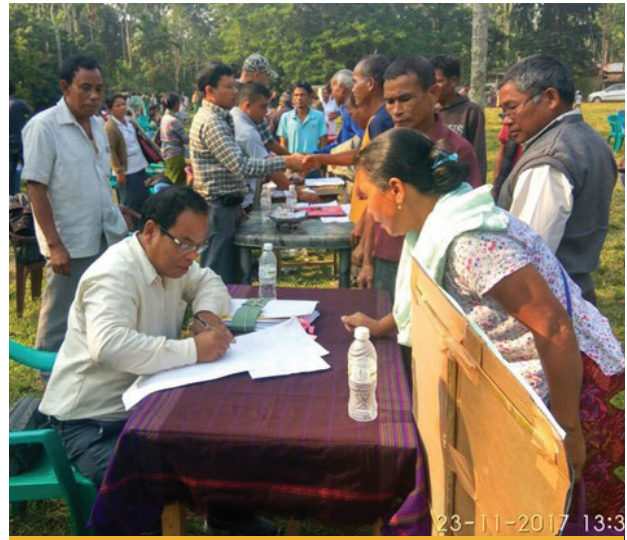
Public hearing in West Jaintia Hills, Meghalaya, where the Department set up desks to engage with citizens on their individual grievances and respond to them.

The strength of the Bhilwara Framework lies in the fact that it made the significant transition from concept to policy. The SAI developed a set of minimum conditions that social audits would have to honor (i.e., the Auditing Standards of Social Audit). The genesis of the Standards legitimized social audits as a formal component of the audit process and led to their being recognized by the State, its executive and eventually the judiciary, too. 5 The Standards begin with laying down the Bhilwara Framework as the minimum principles that must govern institutionalized mechanisms for facilitating citizen oversight and participation in governance. The acceptance and codification of the Bhilwara Framework within the SAI's Standards was a substantial breakthrough. The Bhilwara Framework has also taken root in national policies on accountability framed by the ministry in charge of ensuring social justice and security for Dalits, transgender individuals, manual scavengers, waste pickers, rehabilitating drug addicts, and the elderly. The Framework also serves as the foundation for an ongoing attempt at drafting a legal framework for accountability by the state government of Rajasthan, becoming a fit tribute to where the struggle for these principles began.