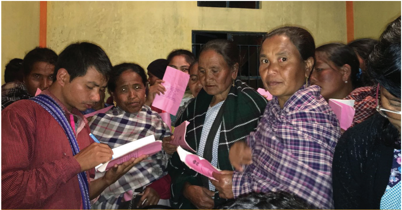
Citizens reading and verifying records with the help of independent social audit resource persons in West Khasi Hills, Meghalaya.

Their considered response on April 14, 2008, in Bhilwara formed the essential architecture of what would be refined, added to, later be referred to, and codified as the Bhilwara Framework of Social Accountability. On that day, they articulated four elements of what accountability should entail. Their articulation was the culmination of almost a year of action and reflection amongst themselves that took place on an ongoing basis.