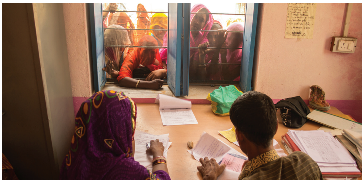
Citizens registering their complaints at a common window in a Gram Panchayat in Rajasthan.