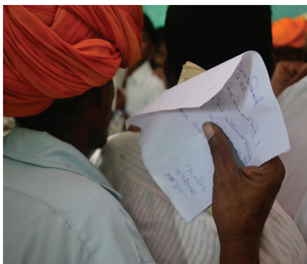
A man waiting to submit his complaint at a Right to Hearing Camp organized by the Government of Rajasthan under the Right to Hearing Act.

Although the roots of the Framework are local, they speak to contemporary challenges being faced by theorists and practitioners of social accountability in different parts of the world. The paper draws on the Framework to demystify social accountability and places its core elements squarely within the framework of social justice, dignity, and democratic governance. It also marks the process of how these principles are enlivened through practice as well as how they are being accepted and institutionalized as minimum standards by different arms and institutions of the State.