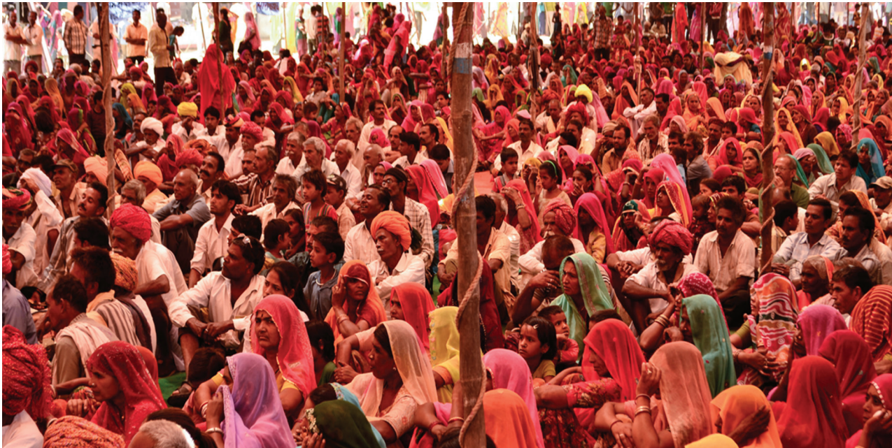
Villagers at a Right to Hearing camp organized by the Government of Rajasthan under the Right to Hearing Act. The camps would ordinarily entail complainants submitting their grievances, getting dated acknowledgement slips ('pink slips') and them participating in an open collective forum where the administration would report publicly on actions taken on individual grievances.

favor of the former only when people have a chance to engage with the State publicly and collectively. Such platforms facilitate public discussion based on evidence and lived realities. Dialogues with those in power, publicly and collectively, cannot be scripted, and they are often a dramatic process of redistribution of power based on evidence and fact. Individuals and communities are empowered and politicized when they experience the practical potential of participatory democracy. Once people have access to and begin to act in collective platforms and are faced with the challenge of making informed choices, democracy moves beyond the two-dimensional aspect of electoral majorities to the complex sphere of deliberation, dialogue, and ethical decision-making. Every voice counts: individually, persuasively, and collectively. For instance, the relevance of a social audit is not only its utility as a feedback tool to know the ground realities of the implementation of any program. Its relevance stems from the fact that it is able to institutionalize a dialogic process that redefines the very concept of expertise. This platform has to be formal and follow norms that allow equal and open participation and make the decision-making process public.