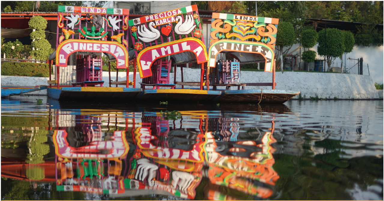
The Xochimilco canals are also a tourist attraction; the trajineras are the boats that take tourists around the canals.

in the southern part of the city, which was satisfied using water from the canals and springs of Xochimilco; the growth of irregular housing, which in addition to occupying environmentally protected lands has led garbage and sewage waters to be discharged into the canals; and the abandonment of traditional activities such as crop-farming to give way to services and tourism. 4 These lands are also used for dumping debris from the earthquakes and old infrastructure works from around the city, and to conduct illegal activities such as operating bars and selling drugs.