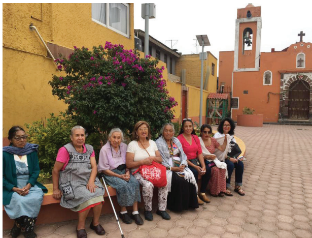
Women of Caltongo Organized at the Plaza de San Francisco Caltongo.

The government's plans to repair a central avenue in the Mexico City neighborhood of Caltongo brought together a group of women of diverse ages and backgrounds who were concerned about the government's corruption and its lack of public consultation and transparency. They began to organize themselves, forming the group Caltongo Organized, and with the help of the civil society organization ControlaTuGobierno, they accessed government budget and contract information and learned about laws and regulations. They educated their fellow community members, advocated for the community's concerns to be taken into account, and monitored the execution of the road project, which allowed them to successfully engage with government authorities to carry out its responsibilities. In this struggle, they learned that the authorities exist to serve the community; they also learned that information is power. With their struggle, the women of Caltongo sowed the seed of a community organization that seeks to make decisions about their territory and their own lives.