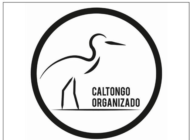
Caltongo Organized logo designed by one of the members.