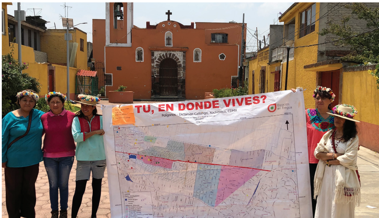
Caltongo Organized members share the results of their community mapping, carried out with @espaciosentregua.