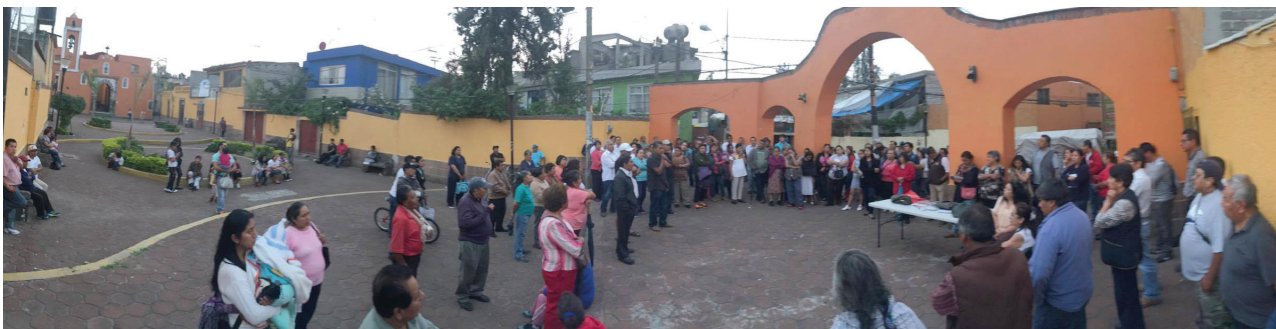
Neighbors meeting at the plaza of Caltongo.

"This has been a struggle on two fronts, one with the government, to get it to pay attention to what we have to say, and do what the people decide, and another with the members of the community, to get them to take an interest in the community's problems," she adds.