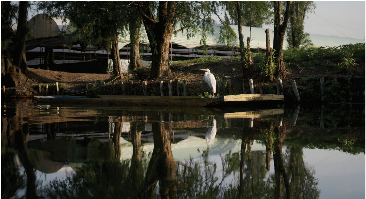
Sunrise over the Xochimilco canals.